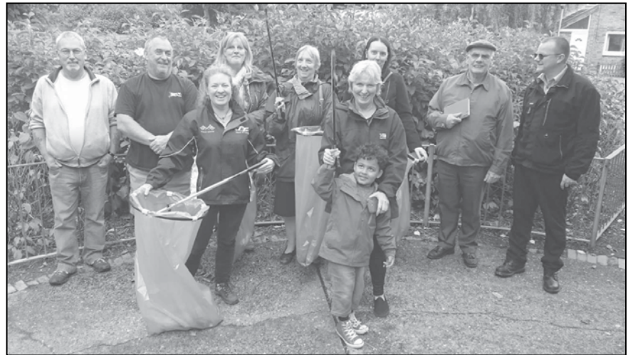
Residents and Councillors meet to discuss a joint initiative to improve their neighbourhood.

“Dawley Hamlets Parish Council wants to make a difference in your neighbourhood”.