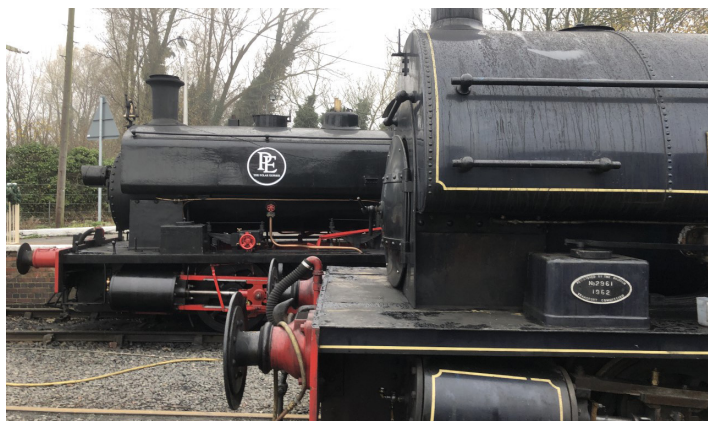
Steam locos ready for the Polar Express Dec 2022