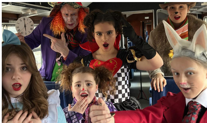
Actors rehearsing for the Easter Alice event 2023