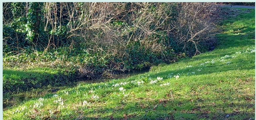
Snowdrops Planted at Horsehay Pool