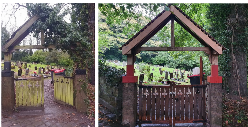
Two views of the Lychgate, February 2020 and October 2020

Doseley churchyard is an important place in the community and many residents will have a personal connection with it. Our intention is to restore its natural beauty, ensure it retains its atmosphere of peace and tranquillity and maintain it in a way that respects the memory of the loved ones who are commemorated there. If you would like to be involved in this continuing project and can help with the work please contact the clerk.